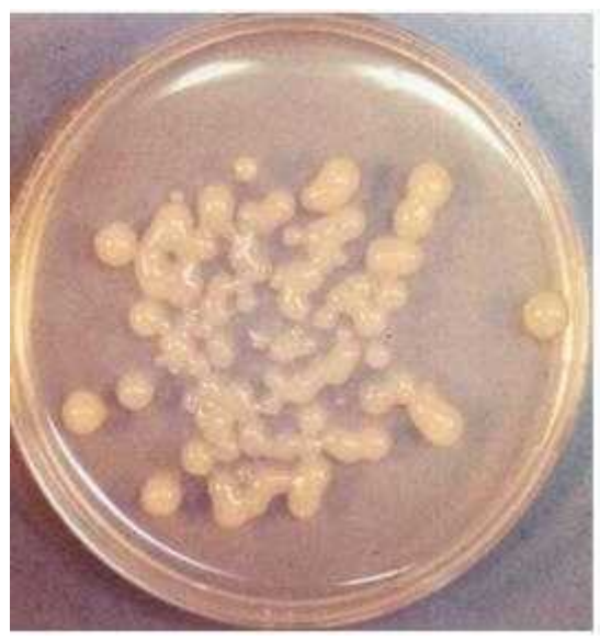
Fig.3: Well separated Bradyrhizobium colonies isolated from a dried root nodule originated in Wild Vigna plant