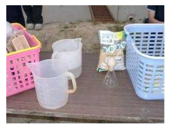
Fig. 1: Paper pot inoculation method of soybean seed with liquid culture of Bradyrhizobium japonicumu USDA110

We compared ten-day old seedlings with B. japonicum inoculated paper pots (IPP), with non-inoculated paper pots (NIPP) and those grown in vermiculite bed without paper pots (DT). These were transplanted to sandy dune field of Niigata, rotated paddy field of Nagaoka and first cropping reclaimed field of Yamakita in 2001. In addition to a basal dressing application of 16 kgN ha<sup>-1</sup> in a surface layer (Control), deep placement of 100 kg N ha<sup>-1</sup> of urea (Urea), 100-day type coated urea (CU-100) and lime nitrogen (CaCN<sub>2</sub>) treatments were applied at the depth of 20 cm using fertilizer injector (Figure 2).