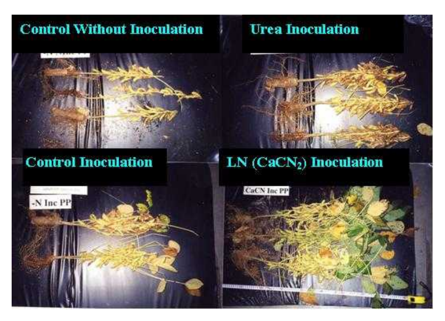
Fig. 3: Comparison of inoculation and urea or calcium cyanamide deep placement in reclaimed Yamakita Field where no indigenous Rhizobium was detected. Upper left (Non-inoculated without N deep placement), Lower left (Inoculated paper pot without N deep placement), Upper right (Inoculated paper pot with urea deep placement), Lower right (Inoculated paper pot with lime nitrogen deep placement)

Among the three fields, the best yield was obtained in the Nagaoka field. Being a rotated paddy field, the Nagaoka field was fertile and with the addition of inoculum and fertilizers as CU-100 and CaCN<sub>2</sub>, seed yield of about 6 t ha<sup>-1</sup> was obtained. Despite the Yamakita field being infertile with no rhizobial population, deep placement of CU-100 or CaCN<sub>2</sub> in combination with inoculation enabled increase of yield by almost four times as much as that of Control without inoculation.