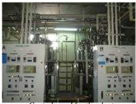
Control panel for the plan

TFAC uses peat imported from Canada as biofertilizer carrier and acetylene reduction method is adopted to measure the N_2 fixation efficiency. It was suggested that sterilization of peat by using Co-60 facility of Shihoro-Nokyo located near the TFAC may bring significant cost saving. The selling price of "Mamezo" is about US$5/40g pack for 10 a while the cost of microorganism itself is about US$0.6.