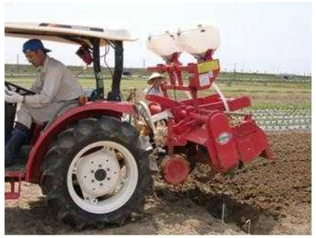
Fig.2: Fertilizer application by deep placement method