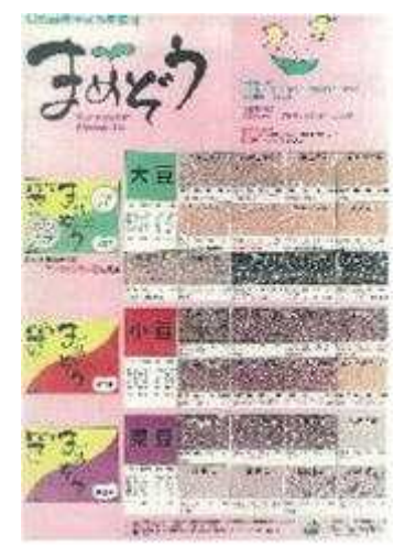
Poster with the information of "Mamezo" products.

In TFAC, 3 kinds of biofertilizers are produced and sold presently. These are "Mamezo" (rhizobia are mixed with peat and the natural organic matters), "R-Processing Seeds" (leguminous seeds inoculated with rhizobia), and "Hyper Coating Seeds" (leguminous grass seed