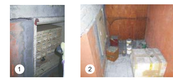
Figure 1. Boxes of Ra-226 needles in the Ministry of Public Health's storage before transferred to CDRWM-BATAN.

In CDRWM-BATAN, spent sealed sources is segregated and collected separately because of their potentially high radiological hazard. Spent sealed sources generally are not removed from their associated shielding or source holders unless adequate precautions are taken to avoid exposure to radiation and contamination. Peripheral components of large irradiation equipment (i.e. those not directly associated with the source) are removed, monitored and disposed of appropriately. Sealed sources are not subjected to compaction, shredding or incineration.