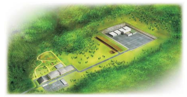
Bird's-eye view of disposal facility (planning)