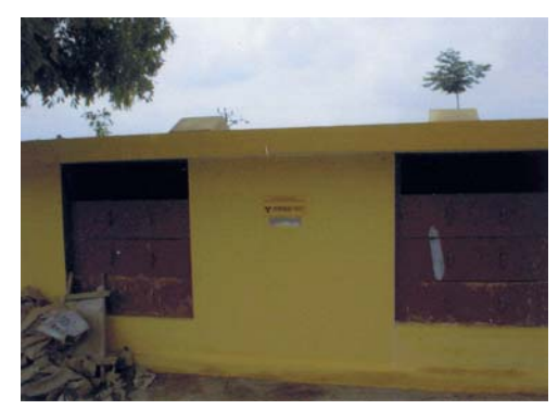
The temporary vault for untreated wastes

For this year, ITRRE has started the upgrading by filling up with soil the area where the tanks are set, such that the ground level is now higher than 2 m. The temporary vault for untreated radwaste, the radwaste treatment house, and the new house for treated radwastes were built. The ITRRE is requesting the support from the Ministry of Science and Technology (MOST) of Viet Nam, the International Atomic Energy Agency (IAEA), and the FNCA to upgrade the current laboratory for radioactive waste treatment, to train key personnel and to carry out researches on radioactive waste treatment and management.