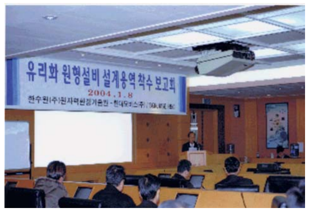
Project kick-off meeting on January 8, 2004

In 1994, NETEC launched a research and development program for vitrification technology in order to treat the low-level radioactive wastes from nuclear power plants. Since then, vitrification process has been developed jointly by NETEC, SGN of France and Hyundai MOBIS. Its performance has been successful-