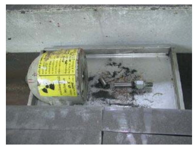
Figure 3 : Ra-226 after Cutting