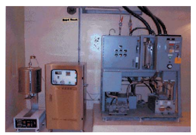
C-14 Sampling Instrument installed in Yonggwang Unit 4

Four sampling instruments were installed in Yonggwang unit 4 on Jan. 2003 to collect the C-14 sample. These sampling instruments will be operated 2 years to produce several kinds of C-14 data. The annual activity is 0.03TBq/GWe, which would be small amount compared to the world's PWR average of 0.22TBq/GWe (UNSCEAR 2000). Based on the result, the environmental effects of C-14 at PWR will be evaluated and will provide us an optimal C-14 monitoring method.