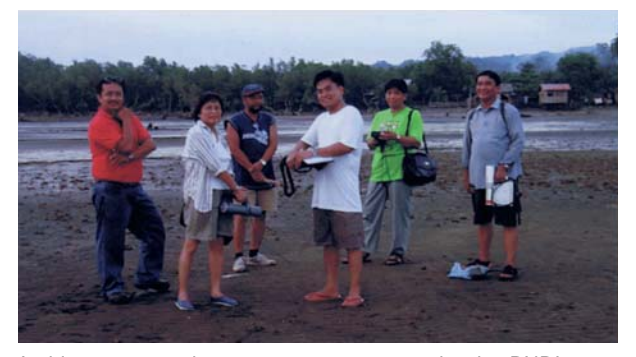
Ambient gamma dose rate measurements by the PNRI team, industrial Manager and NGO using a portable spectrometer and a scintillometer

The study assuaged LGU and NGO apprehensions regarding the release of radioactive materials into the environment and its possible health implications if PG is used in the town reclamation project. Thus, the PNRI was instrumental in bridging the perceptual and socio-economic gaps between the LGU and NGO, on the one hand, and the industry, on the other. Public acceptance is needed in the continuous operation and economic growth of industries using raw materials containing naturally-occurring radionuclides. Hence, collaboration between the LGU and the NGO and the Industrial Manager in the study is a management strategy which could be used to promote peaceful uses of nuclear technology including TENORM.