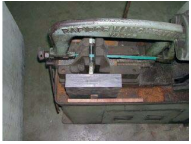
Figure 2 : Automatic Sawing