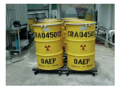
Figure 5 : Ra-226 Conditioned Drums