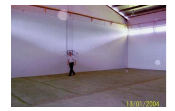
The new interim storage building.