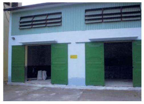
The radwaste treatment house