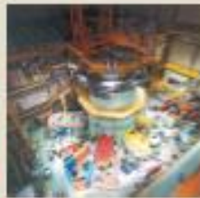
HANARO (Korea) Peer Reviewed in Feb. 2004