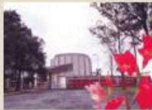
DNRR (Viet Nam) Peer Reviewed in Jan. 2003