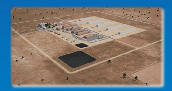
Artist's impression of facility