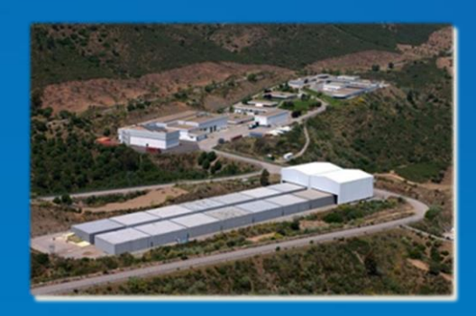
El Cabril facility, Spain