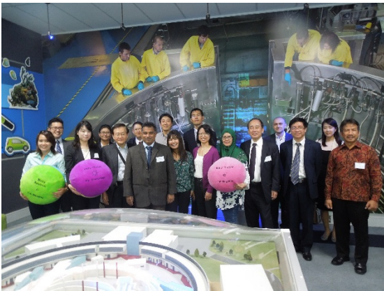
At Discovery Centre of ANSTO

The FNCA 2018 Workshop on Radiation Safety and Radioactive Waste Management (RS&RWM) was held from 17th to 19th October 2018, at the Adina Apartment Hotel and Australian Nuclear Science and Technology Organisation (ANSTO). The workshop was jointly organised by the ANSTO and the Ministry of Education, Culture, Sports, Science and Technology (MEXT) of Japan.