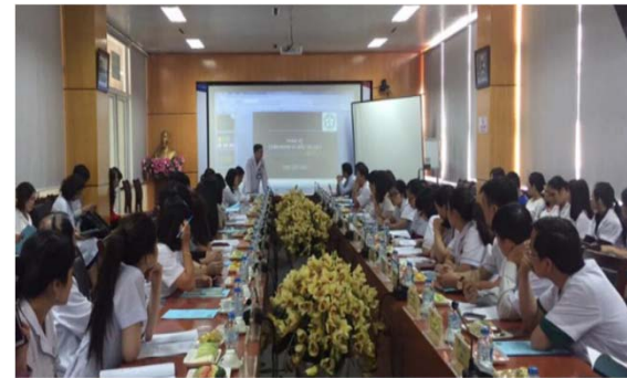
Lectures on introducing protocols developed in FNCA project