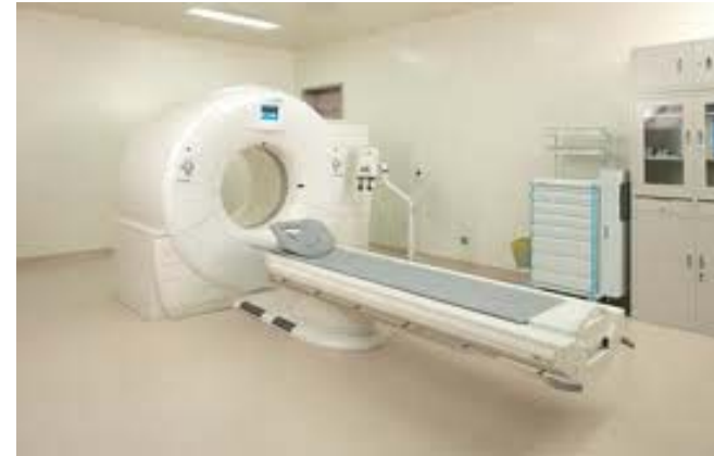
256 slices CT scanner