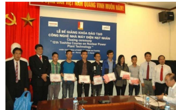
Training course on NPP Technology (TOSHIBA, HUST & NTC)