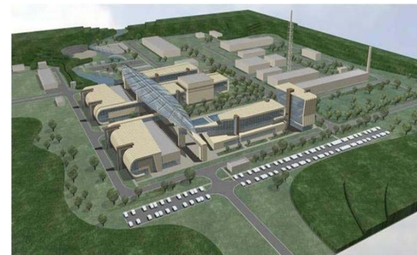
Lay-out of CNEST

The RCNEST (planned to be located at Long Khanh, Dong Nai - 70km from HCM city) will have a new research reactor with power 10MW (upgradable 15MW) and 6 research units.