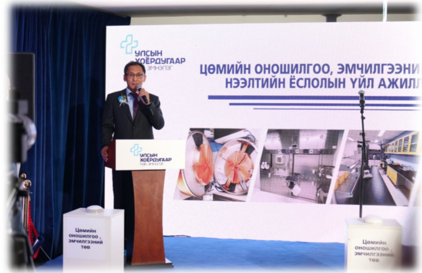
PET/CT facility opening ceremony: 2021.08.26

Beam: Proton – 9.6MeV Production: ^{18}\text{F}